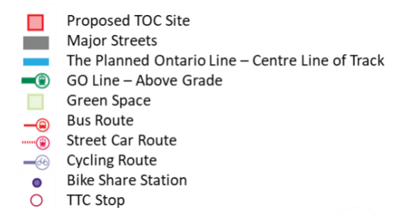
Figure 1-1. Eastern Avenue TOC Site Map